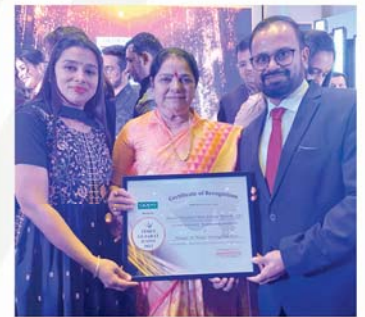
Times gujarat icons award winner 2022