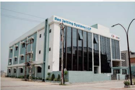
20000 Sq. Feet

We are Ren Jetting Systems LLP, a company that specializes in the manufacture, supply and export of High Pressure Triplex Plunger Pumps & Systems, We already did Business in U.A.E, Saudi Arabia, Nepal, Philippines & many more.